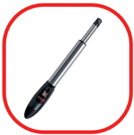
0.4 TON EACH