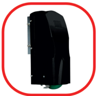
0.6 TON EACH